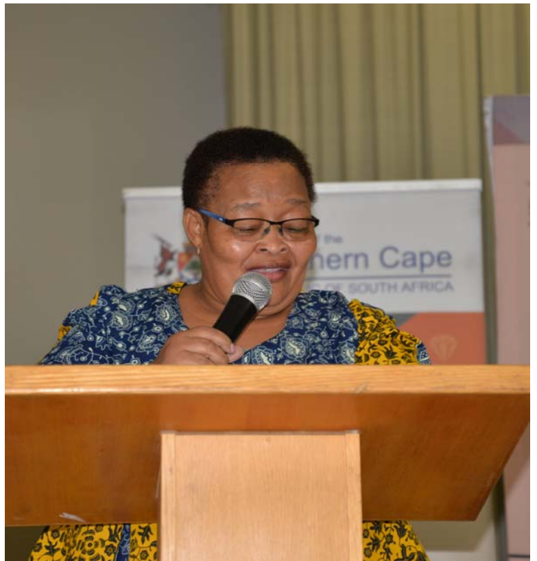
Premier Sylvia Lucas

The housing system will indeed be properly channelled in order to cater for all. We as the government strive to bring back dignity and integrity to our people, said the Premier