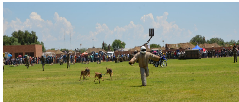
Demonstrations by Dog Unit

Meanwhile activities that were performed for the official opening are parachute landing by the South African Para troopers from SANDFs' special force. It was followed by the South African Specialized Infantry Capabilities which performed obstacle crossing with motor bikes and sniffer dogs. The day continued with integrated attacks towards the enemy with dogs, horses and bikes. The daily activities were concluded by the Navy Squad with a demonstration of how to strip and assemble firearms.