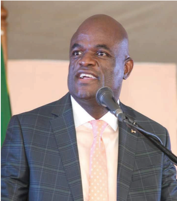
Northern Cape Premier Dr. Zamani Saul

Which cares for the vulnerable and make life worth living for them, this would entail increased number of households with access to the grid, water and adequate sanitation. Such a province is at the cutting-edge of the Fourth Industrial Revolution and prioritizes quality education, training and retraining of the youth.